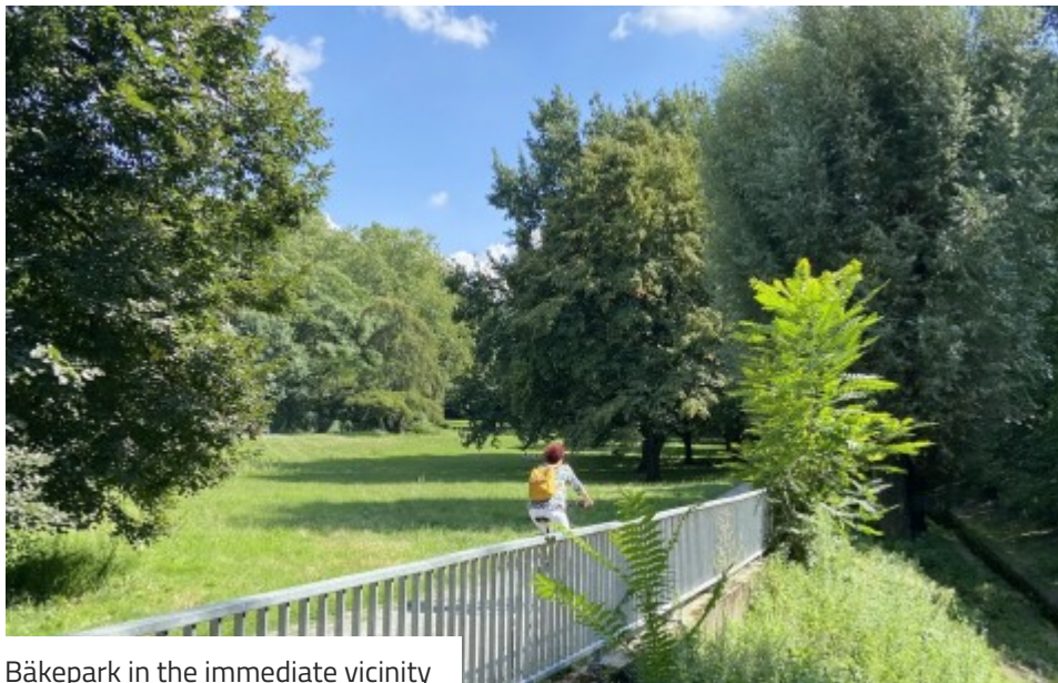
Bäkepark in the immediate vicinity