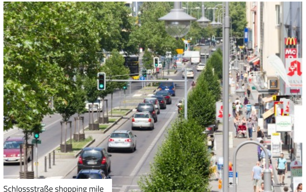
Schlossstraße shopping mile