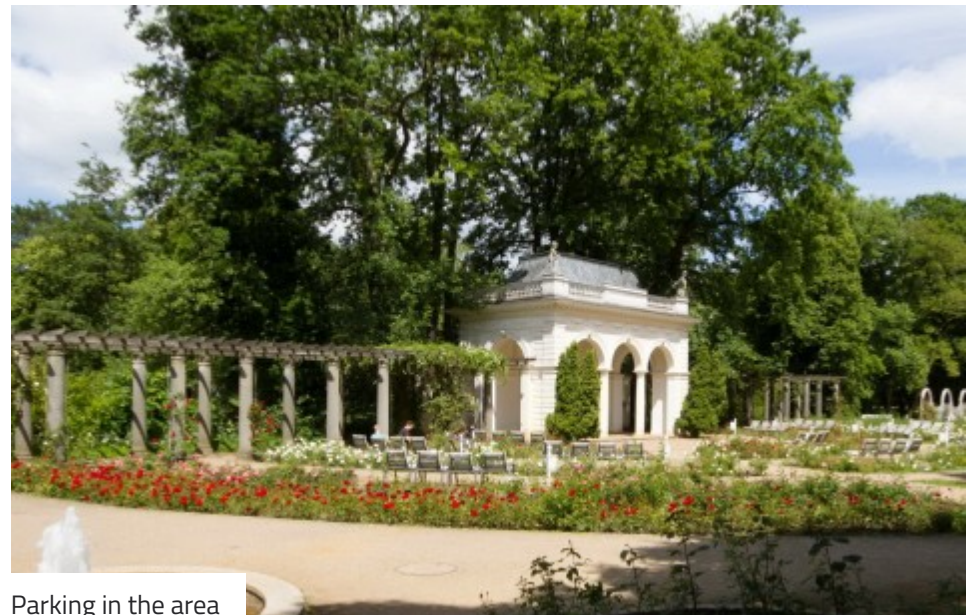
Parking in the area