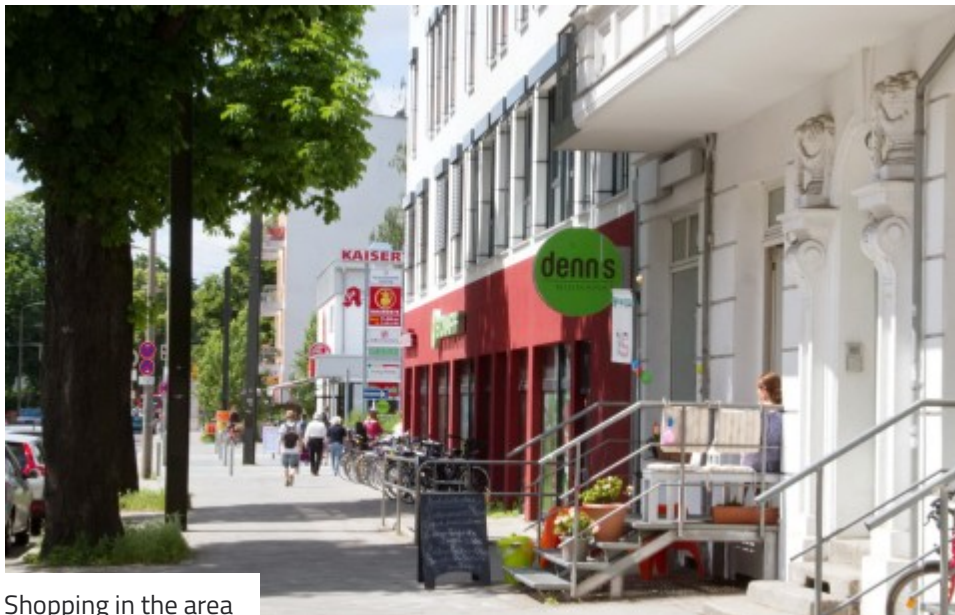
Shopping in the area